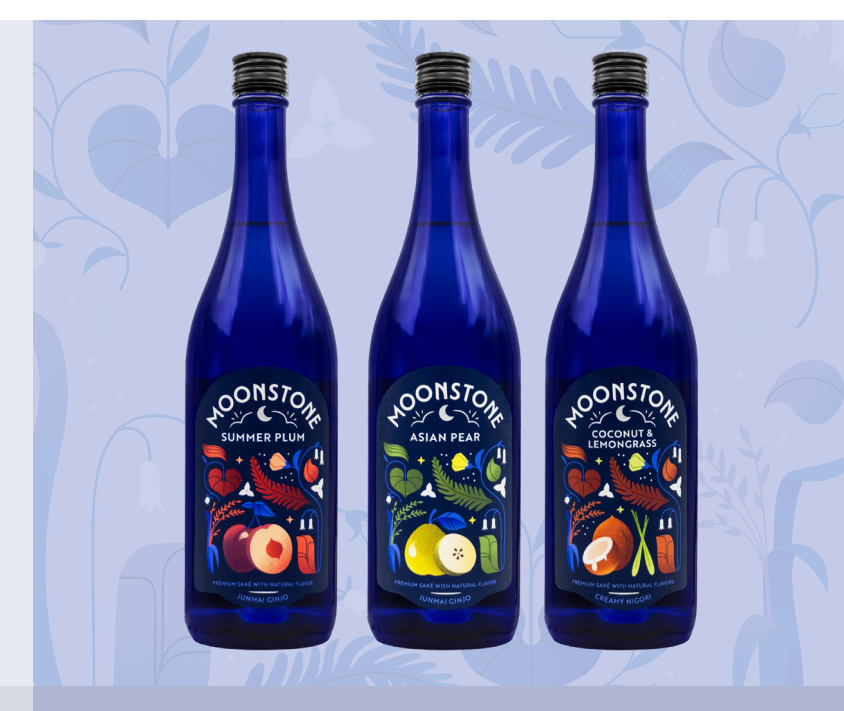
2025: All New Design!